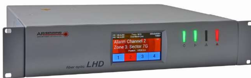
19" Rack Mount