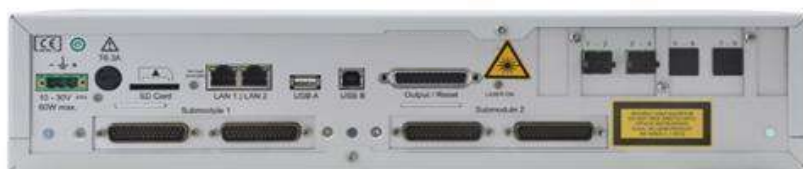
Rear / bottom view